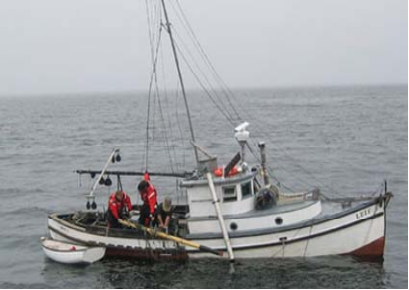
Fishing Vessel Leif; July 6, 2005.

From 1994 through 2004, 1,398 vessels were lost. Of those vessels, over 80% did not have a voluntary dockside examination decal. This article highlights the fact that the leading cause of fatalities in the commercial fishing industry is loss of the vessel.